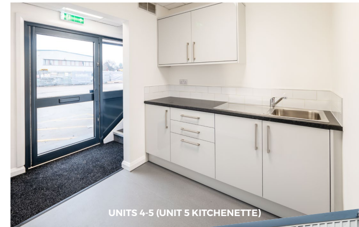
UNITS 4-5 (UNIT 5 KITCHENETTE)