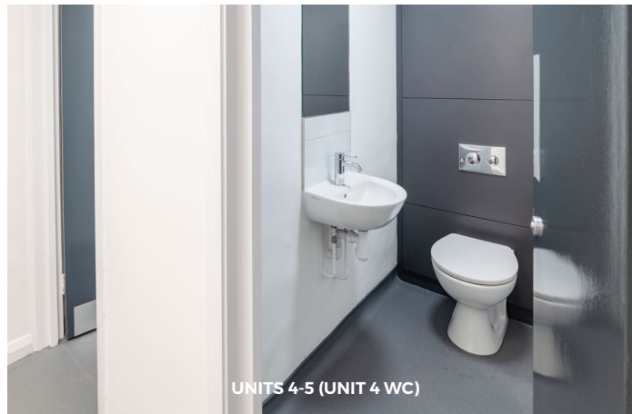
UNITS 4-5 (UNIT 4 WC)