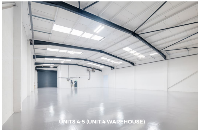
UNITS 4-5 (UNIT 4 WAREHOUSE)