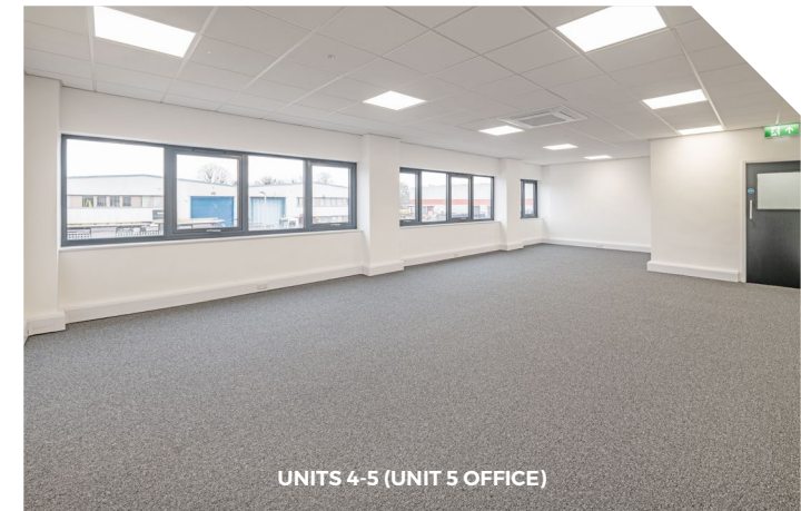
UNITS 4-5 (UNIT 5 OFFICE)