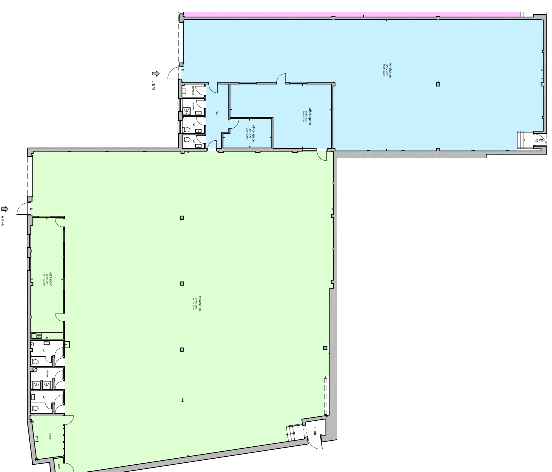
N/A - ground floor plan 1:200 @A1

Internal area/measurements adhere to the International Property Measuring Standards (IPMS) and are in accordance with the International Valuation Standards (IVS) as published by the Royal Institute of Chartered Surveyors (RICS)